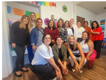
Speaking of Women Series