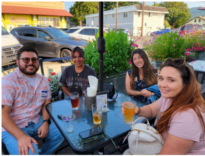
Members network at the Multi-Chamber After Hours