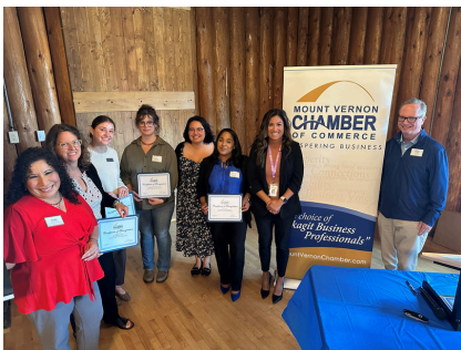
Members receive renewal certificates at the Membership Luncheon