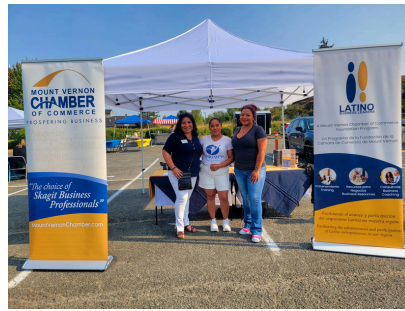
Latino Business Leaders at Triumph Teen Center event