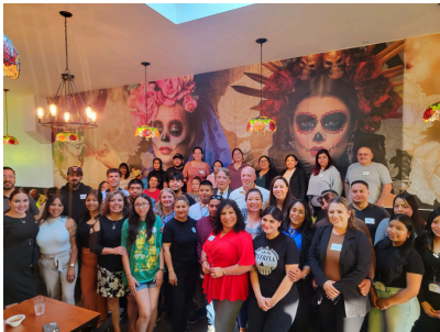
Latino Business Leaders Kickoff