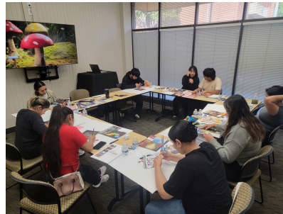
Latino Business Youth