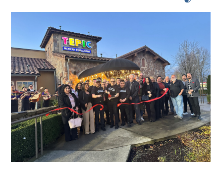
Ribbon Cutting at Tepic Mexican Restaurant