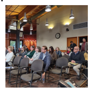
Skagit Chamber Alliance Legislative Send-Off