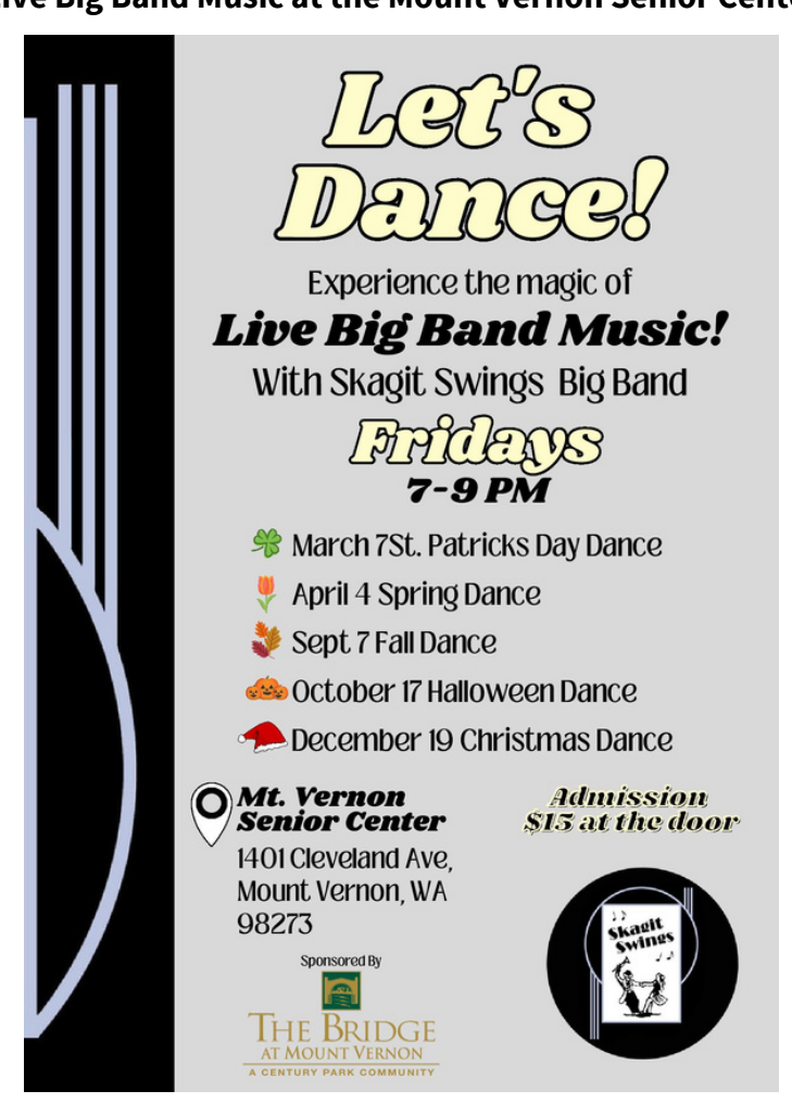
Let's Dance! Live Big Band Music at the Mount Vernon Senior Center

Barron Heating AC Electrical & Plumbing is highlighting a different charity or non-profit organization each month that holds high esteem among Team Barron and within the communities it serves. Barron KARES (Kindness, Appreciation, Response, Empathy, and Service) provides a charitable donation of $110 on select purchases, such as tankless water heaters, heat pumps, solar installations, generators, and more.